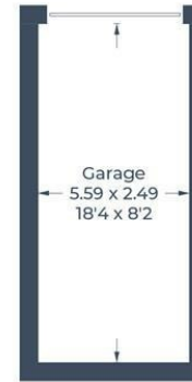
(Not Shown In Actual Location / Orientation)

Illustration for identification purposes only, measurements are approximate, not to scale. © CJ Property Marketing Produced for Fine & Country